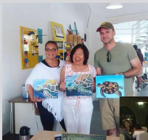
Lady Josephine could not resist a visit to view the beautiful art collection.