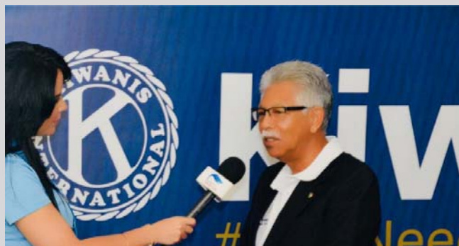
Governor Bobby being interviewed by a media house in Aruba.