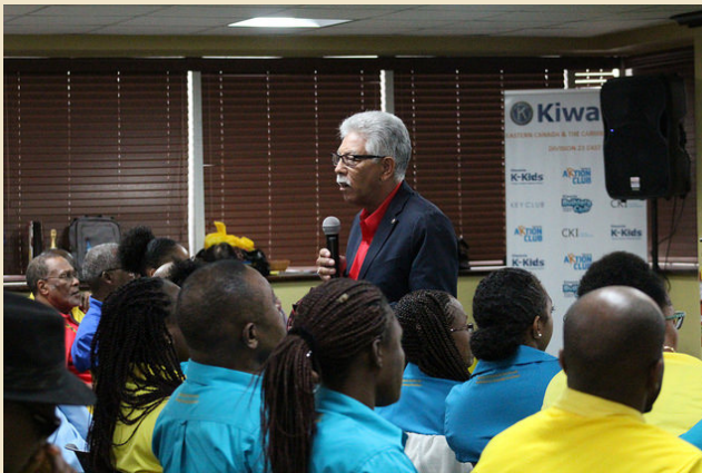
Governor Bobby addresses attendees of 23East Divisional Council Meeting.