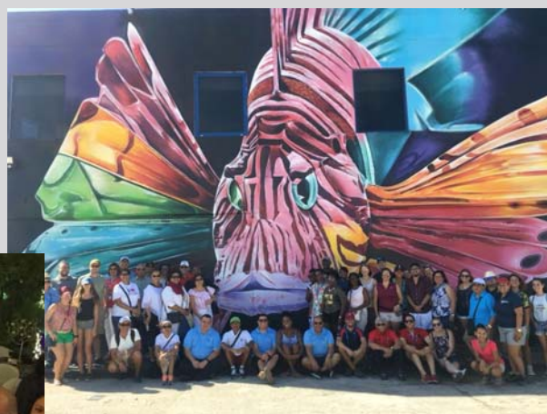
Scenic art walking tour in San Nicolas as part of the closing activity of Kiwanis Divisional Council Meeting Division 26.