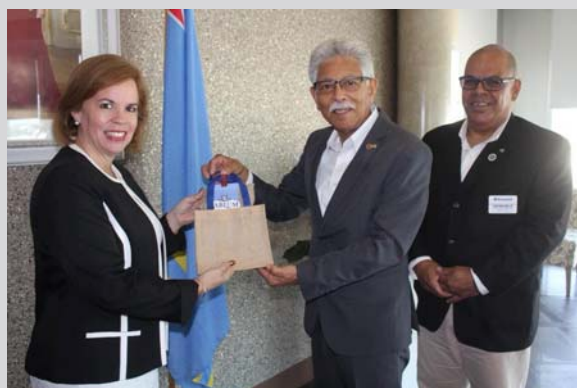
Governor Bobby presents Prime Minister Evelyn with a package of Jamaican Jablum coffee.