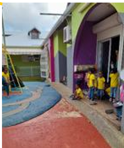
Halte-Garderie de Ste Rose