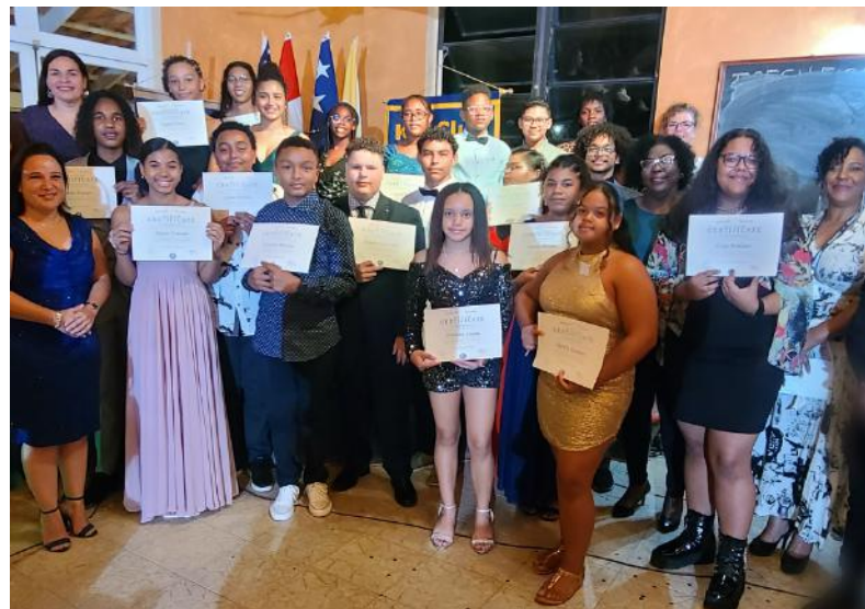
Above Photo: Club Charter Members Photo to the Left: Board of Directors

On Saturday February 19th, 2022, Key Club Kibrahacha Liseo Boneriano was officially installed at Eddy's Restaurant. Key Club Kibrahacha Liseo Boneriano was organized on November 18th, 2021 and consists of 21 charter members between the ages of 12 and 19 who go to Liseo Boneriano. Bonaire's first Key Club is an initiative of to contribute to the development of young people in high school.