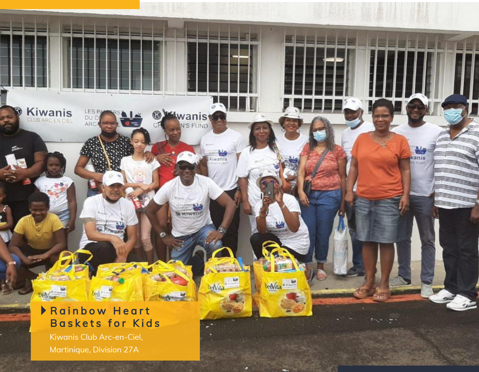
► Rainbow Heart Baskets for Kids Kiwaniis Club Arc-en-Ciel, Martinique, Division 27A

EC&C DISTRICT CONVENTION 2022 is weeks away and the District Convention Committee is ready to welcome you