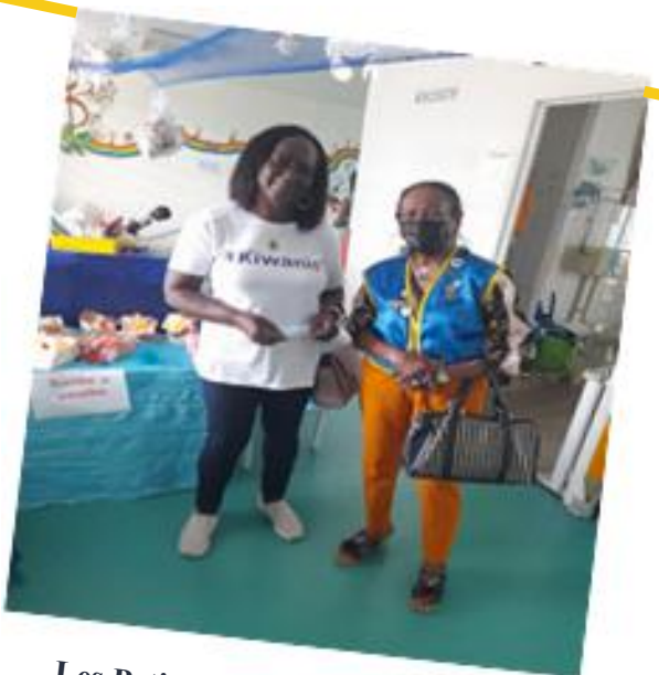
Les Petites lumières de 3Rivières

Special thanks also to Centrale Bébé au Moule and all other donors who responded to our appeal. Due to their support and cooperation, three structures will be erected at the below chosen nurseries.