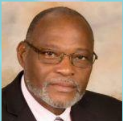
Distinguished Governor Melford Clarke